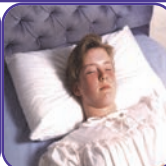
Ortho Neck Pillows