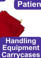
Handling Equipment Carrycases