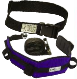
Transfer, Walker & Support Belts