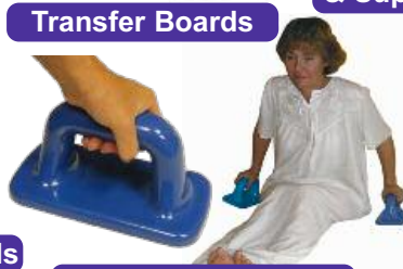
Patient Hand Blocks