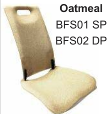
Oatmeal BFS01 SP BFS02 DP