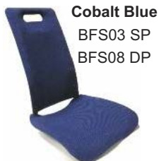
Cobalt Blue BFS03 SP BFS08 DP