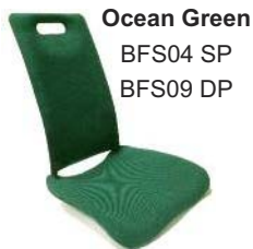
Ocean Green BFS04 SP BFS09 DP