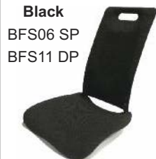
Black BFS06 SP BFS11 DP