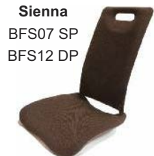
Sienna BFS07 SP BFS12 DP