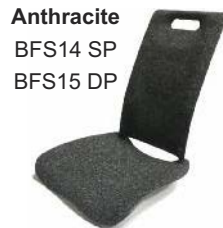
Anthracite BFS14 SP BFS15 DP