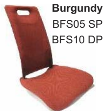
Burgundy BFS05 SP BFS10 DP