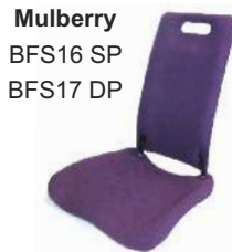
Mulberry BFS16 SP BFS17 DP