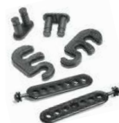
Hinge & Hingelock