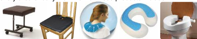
Leg Rests Wedge Cushion Therapearl Wrap Gel Neck Cushions Raised Toilet Seats

MEDesign supply more than 100 products to relieve backpain in every area of daily life. A few of these products include: